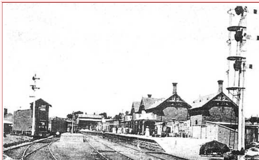
Murray Bridge Station 1910 The Signal Cabin is on the left