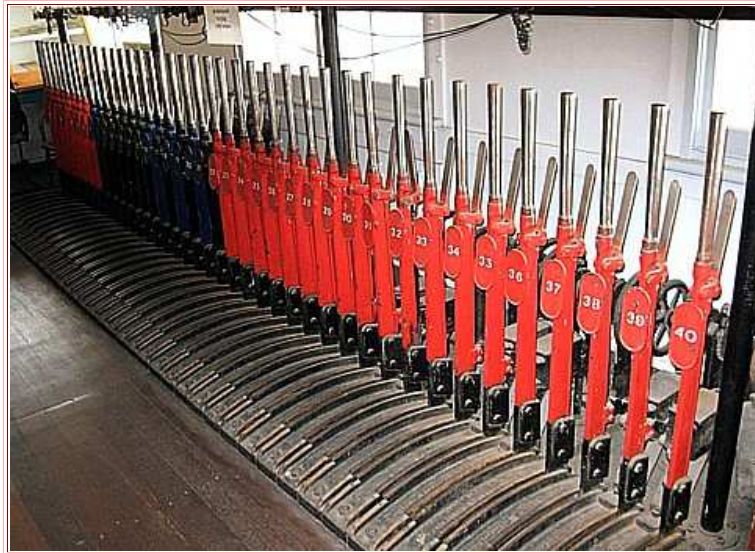
Typical Signal Box - Signal & Points Control The levers mechanically control signal and rail switch points via cables and tubular rods which run alongside the lines