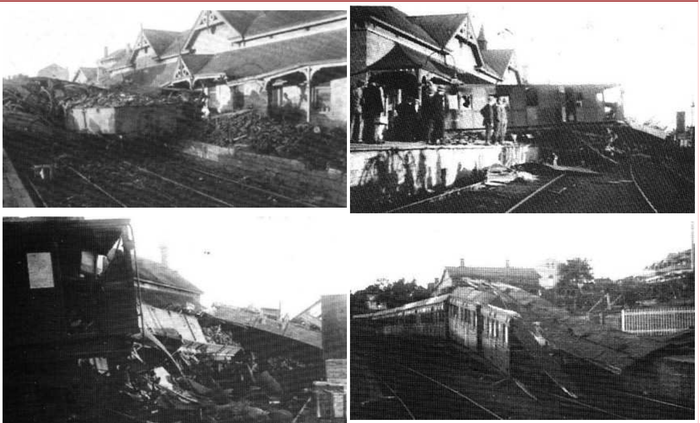
Train Smash in Murray Bridge Station

So my father cleared everybody from the station and set the rail line switch points for the truck to ram the stationary carriages and stop it in its path. The result is shown in those photographs. One carriage ended up in the refreshment rooms but, as the station had been cleared, nobody was hurt.